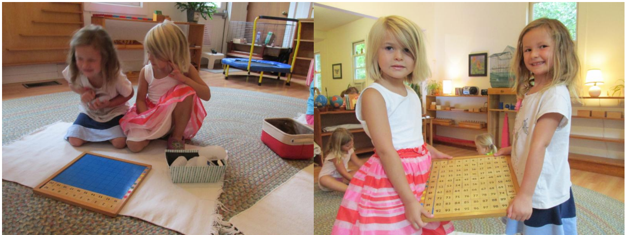
Working collaboratively on the Hundred Board.